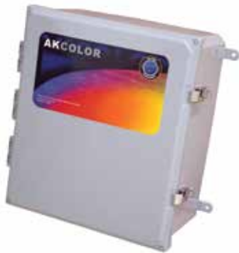
AKColor Colorimetric Chemical Feeder