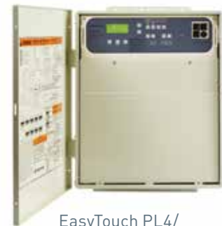
EasyTouch PL4/ PSL4 System

Note: EasyTouch PL4/PSL4 Systems use the power center enclosure that does not contain a breaker base.