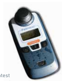
Palintest Pooltest 3

Regular testing of pool water is essential for effective disinfection and pH control. The Palintest Pooltest 3 offers the ideal answer - a 3 parameter instrument which is quick, accurate and reliable.