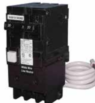
GFCI Circuit Breakers