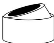
Hard Plumbing Adapter