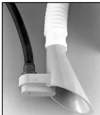
Sand Vac 542090