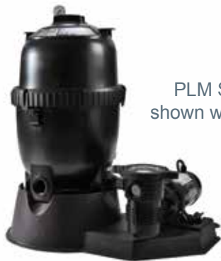
PLM Series Systems shown with OptiFlo® Pump

Convenience and virtually maintenance-free operation make this aboveground system a smart choice. Featuring Sta-Rite's modular media technology, these systems handle dirt loads of up to 15 times more than sand filters of equivalent size. Available with rugged, large-capacity OptiFlo Series pump.