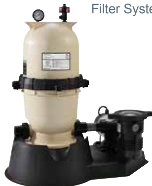
Clean & Clear Filter System

The Clean & Clear Filter System pairs the OptiFlo® Pump with the Clean & Clear Cartridge Filter, a high quality filtration unit using a thermoplastic chemical-resistant tank. All models are equipped with easy spin-on unions for plumbing hookups. Available in 50, 75, 100, 125, 150, 175 & 200 sq. ft. sizes.