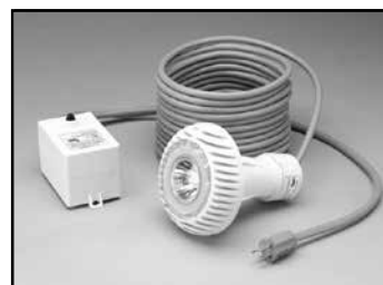
Quasar Non-return light for Aboveground Pools 98605300

CALIFORNIA PROPOSITION 65 WARNING ⚠️ WARNING: Cancer and Reproductive Harm. ⚠️ AVERTISSEMENT: Peut Causer le Cancer et des Dommages au Système Reproducteur. ⚠️ ADVERTENCIA: Cáncer y Daño Reproductivo. www.p65warnings.ca.gov P182017A