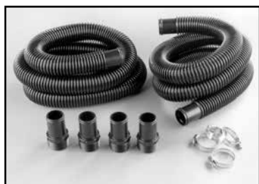
6 ft. Hose Kit 155151 12 ft. Hose Kit 155005