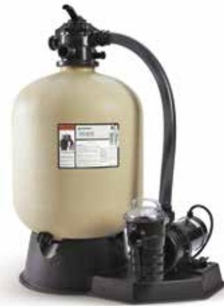
Sand Dollar Filter System

Our blow-molded process creates a one piece, non-corrosive tank of unequaled strength and durability. This pump and filter system provides excellent performance at an affordable price.