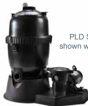
PLD Series Systems shown with OptiFlo® Pump

Sta-Rite combines outstanding water purity and carefree operation in a system package. Evolution of the proven modular media technology delivers D.E. filtration in a simple, one-piece module design. Available with rugged, large-capacity OptiFlo Series pump.