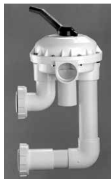
HiFlow Valve Kit 261050