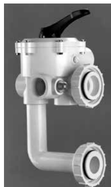
Multiport Valve Kit 261055