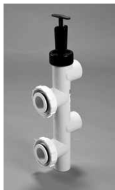
PVC Slide Valve Kit 263064