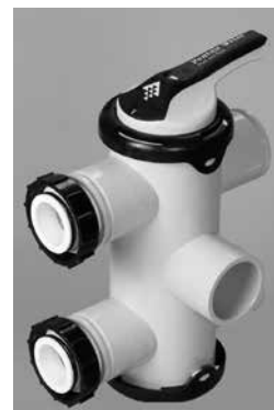
eco select™ FullFloXF® Backwash Valve Kit 263080