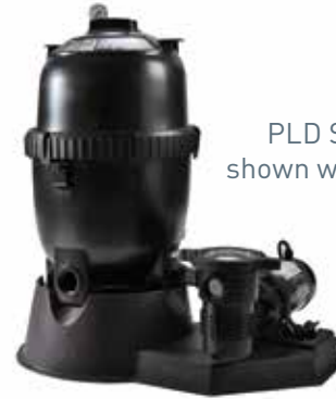
PLD Series Systems shown with OptiFlo® Pump

Sta-Rite combines outstanding water purity and carefree operation in a system package. Evolution of the proven modular media technology delivers D.E. filtration in a simple, one-piece module design. Available with rugged, large-capacity OptiFlo Series pump.