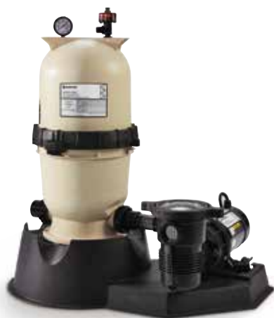
EasyClean D.E. Filter System