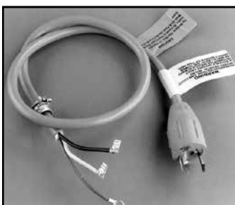
3 ft. Twist Lock cord 155234