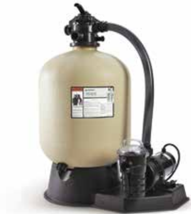
Sand Dollar Filter System

Our blow-molded process creates a one piece, non-corrosive tank of unequalled strength and durability. This pump and filter system provides excellent performance at an affordable price.