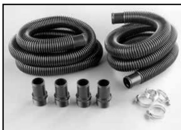
6 ft. Hose Kit 155151 12 ft. Hose Kit 155005