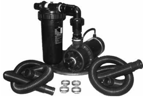
Predator II Mini-Cellular Media Filter System

The Predator II Mini-Cellular Media System offers a smaller 25 sq. ft. filter and 40 GPM pump without pot.