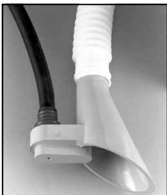
Sand Vac 542090