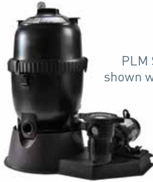
PLM Series Systems shown with OptiFlo® Pump

Convenience and virtually maintenance-free operation make this aboveground system a smart choice. Featuring Sta-Rite's modular media technology, these systems handle dirt loads of up to 15 times more than sand filters of equivalent size. Available with rugged, large-capacity OptiFlo Series pump.