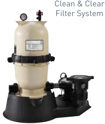
Clean & Clear Filter System

The Clean & Clear Filter System pairs the OptiFlo® Pump with the Clean & Clear Cartridge Filter, a high quality filtration unit using a thermoplastic chemical-resistant tank. All models are equipped with easy spin-on unions for plumbing hookups. Available in 50, 75, 100, 125, 150, 175 & 200 sq. ft. sizes.