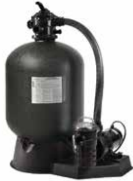
Cristal-Flo II Filter System shown with Dynamo® Pump